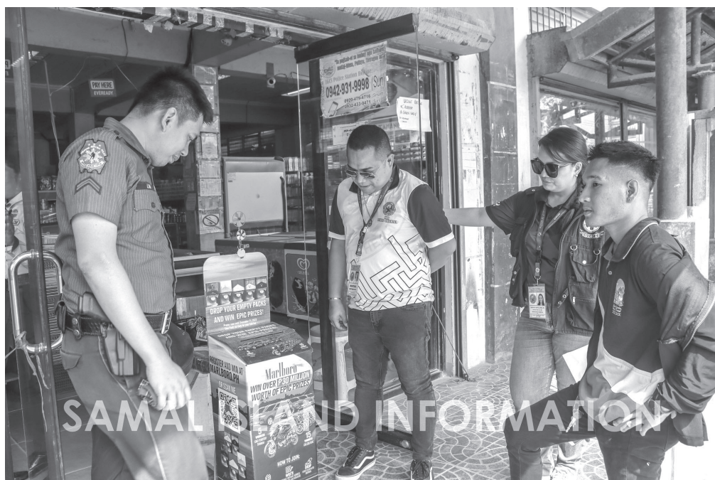
THE Island Garden City of Samal achieved “Hall of Famer” status in the Regional Red Orchid Award as health evaluators recognized its anti-smoking drive on Oct. 5, 2023.