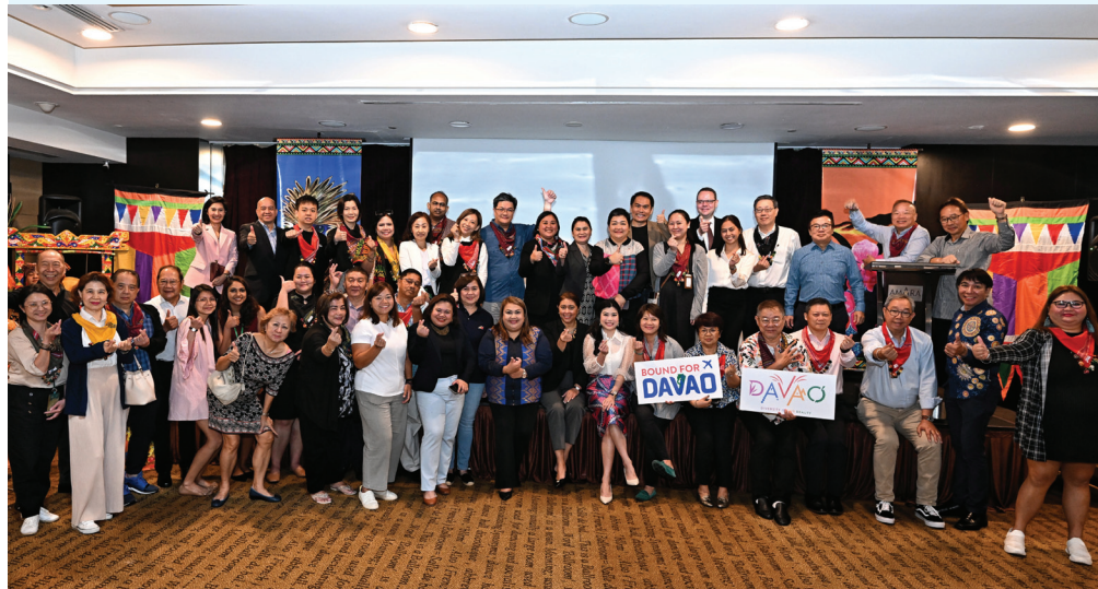
DAVAO delegation together with the Singapore tour operators