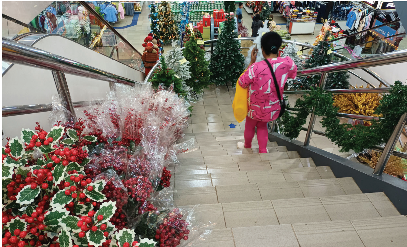
IT'S STILL OCTOBER, but a department store in Malaybalay City is already displaying Christmas decorations for sale on Oct 3, 2023. The Philippines is known as the country with the longest Yuletide celebration.