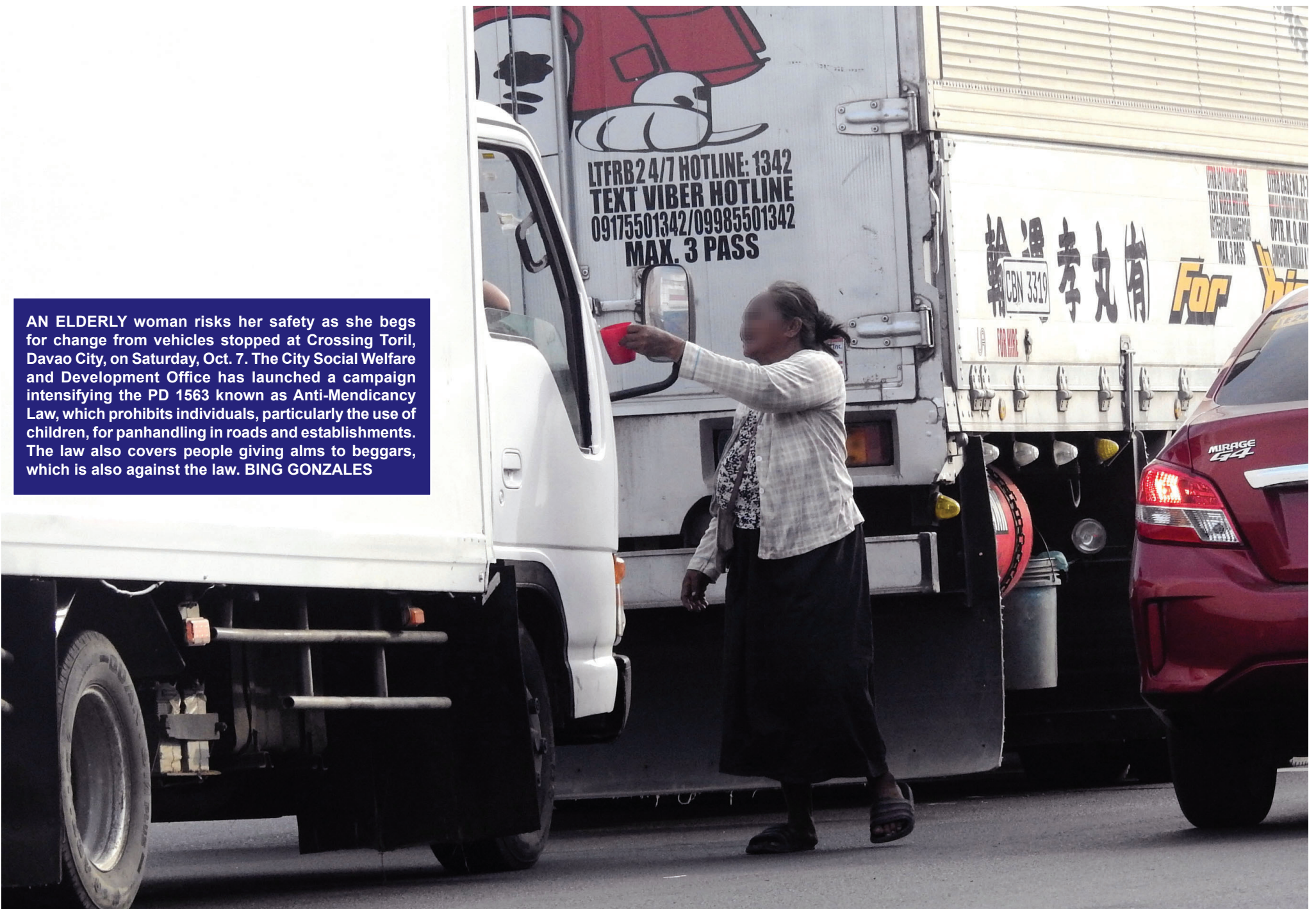
AN ELDERLY woman risks her safety as she begs for change from vehicles stopped at Crossing Toril, Davao City, on Saturday, Oct. 7. The City Social Welfare and Development Office has launched a campaign intensifying the PD 1563 known as Anti-Mendicancy Law, which prohibits individuals, particularly the use of children, for panhandling in roads and establishments. The law also covers people giving alms to beggars, which is also against the law.

DOT XI holds business mission in Singapore on PAGE 12