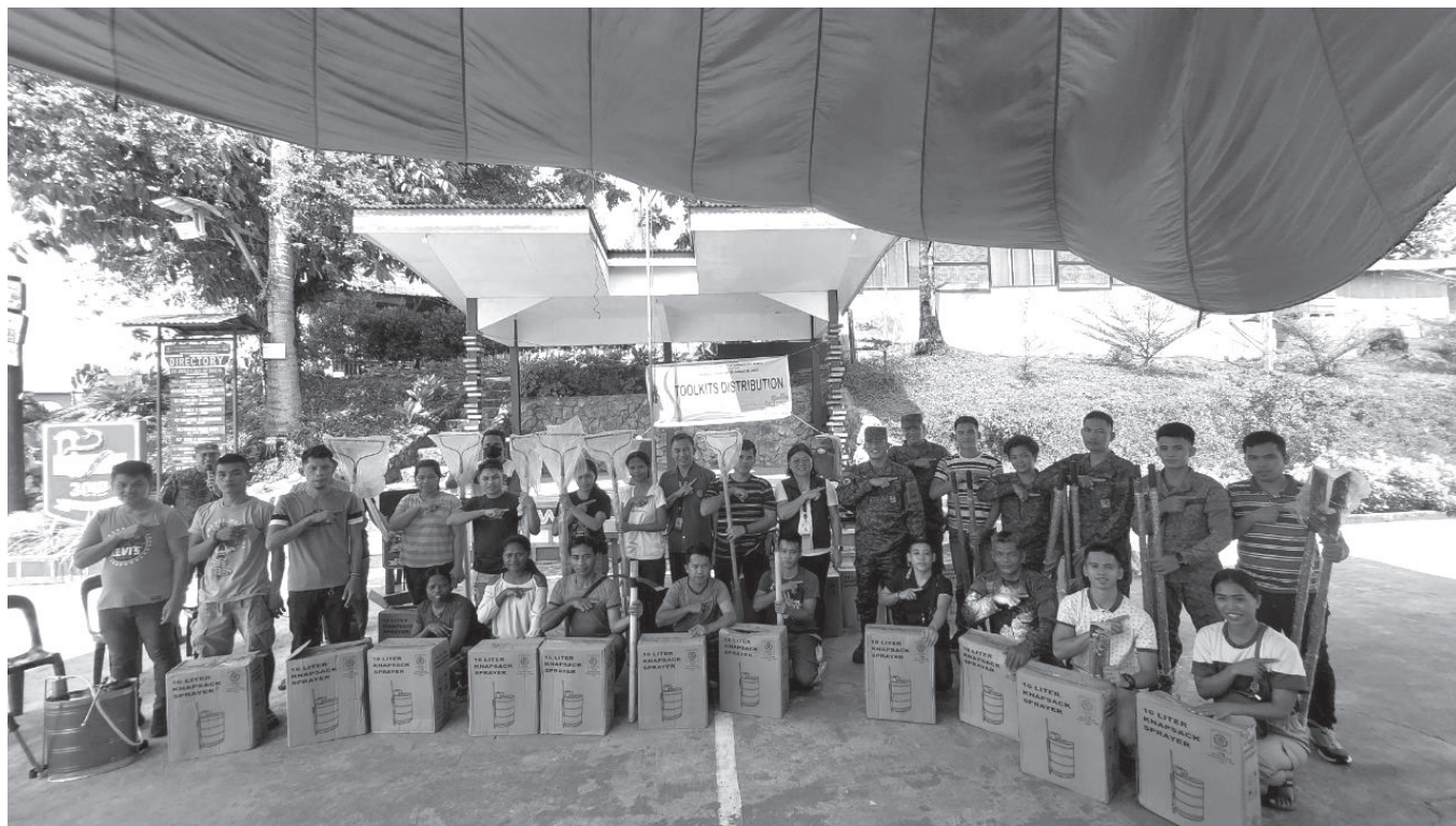
Twenty-eight former rebels get a new lease in life after completing training and receiving livelihood packages from Tesda-Surigao del Norte.